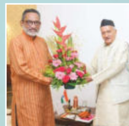
Governor of Maharashtra & Impex Chamber Mg. Dir.