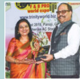
President of Goa Chamber of Commerce welcomed