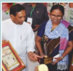
Sri Lankan Minister & Kerala Health Minister