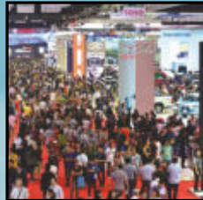
In Venue Displays