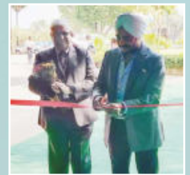
Hotels & Restaurants Association President