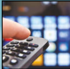
TV & Cable Channels