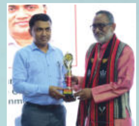
Hon Chief Minister of Goa & Impex Chamber Mg. Dir.