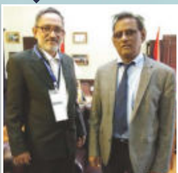
President of Mauritius & CMD of Impex Chamber