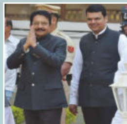
H. E. Governor Rao & CM Fadnavis of Maharashtra