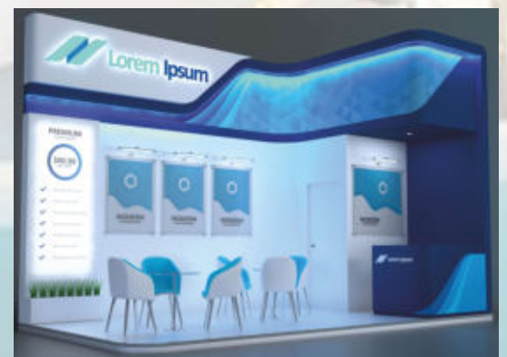
Stall image is for indication only