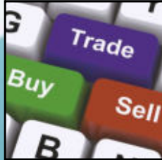
Associations & Chambers